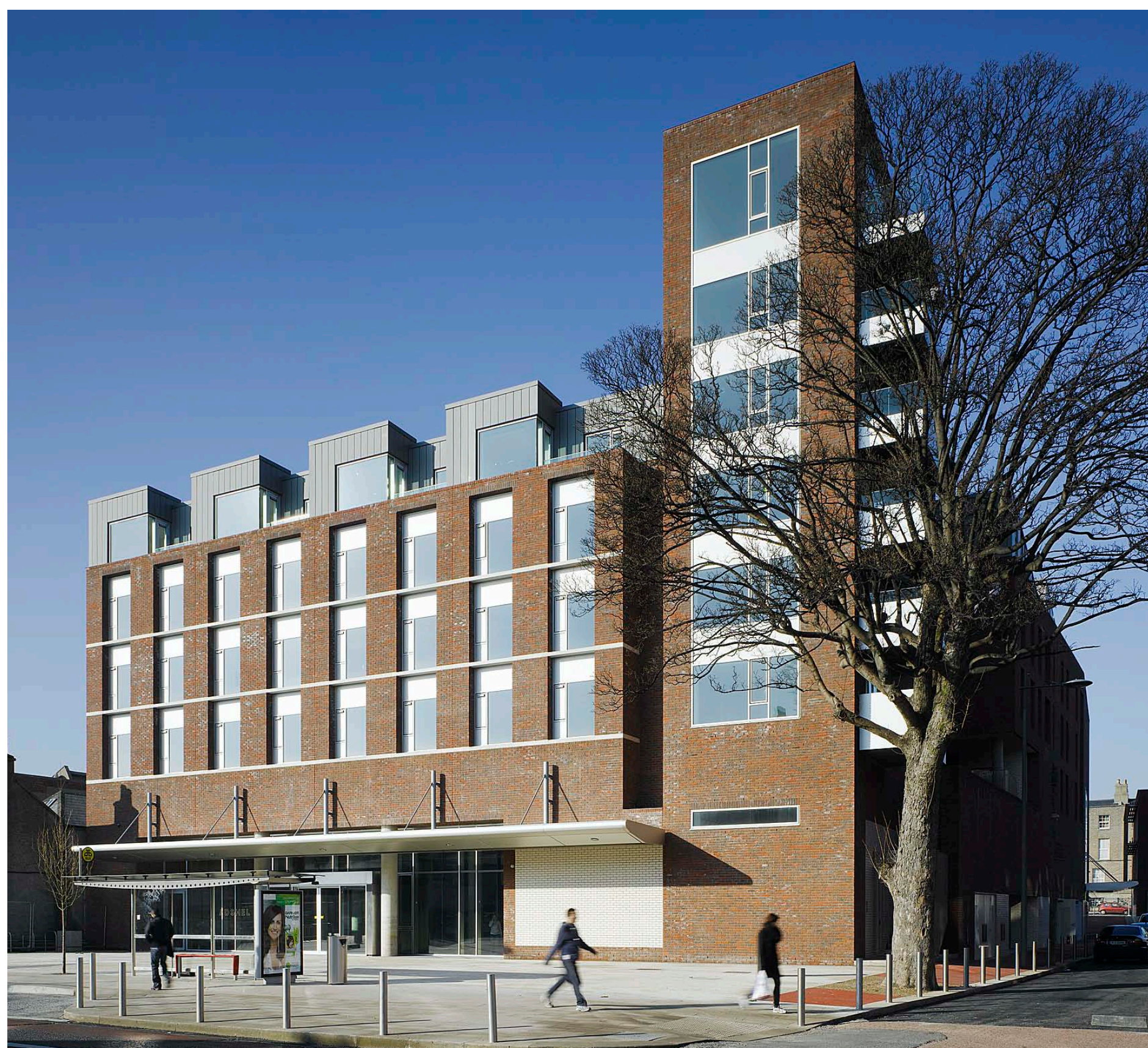
Rathmines Square Pool & Apartments

Walking: 8.3 minutes from Ranelagh Luas Stop