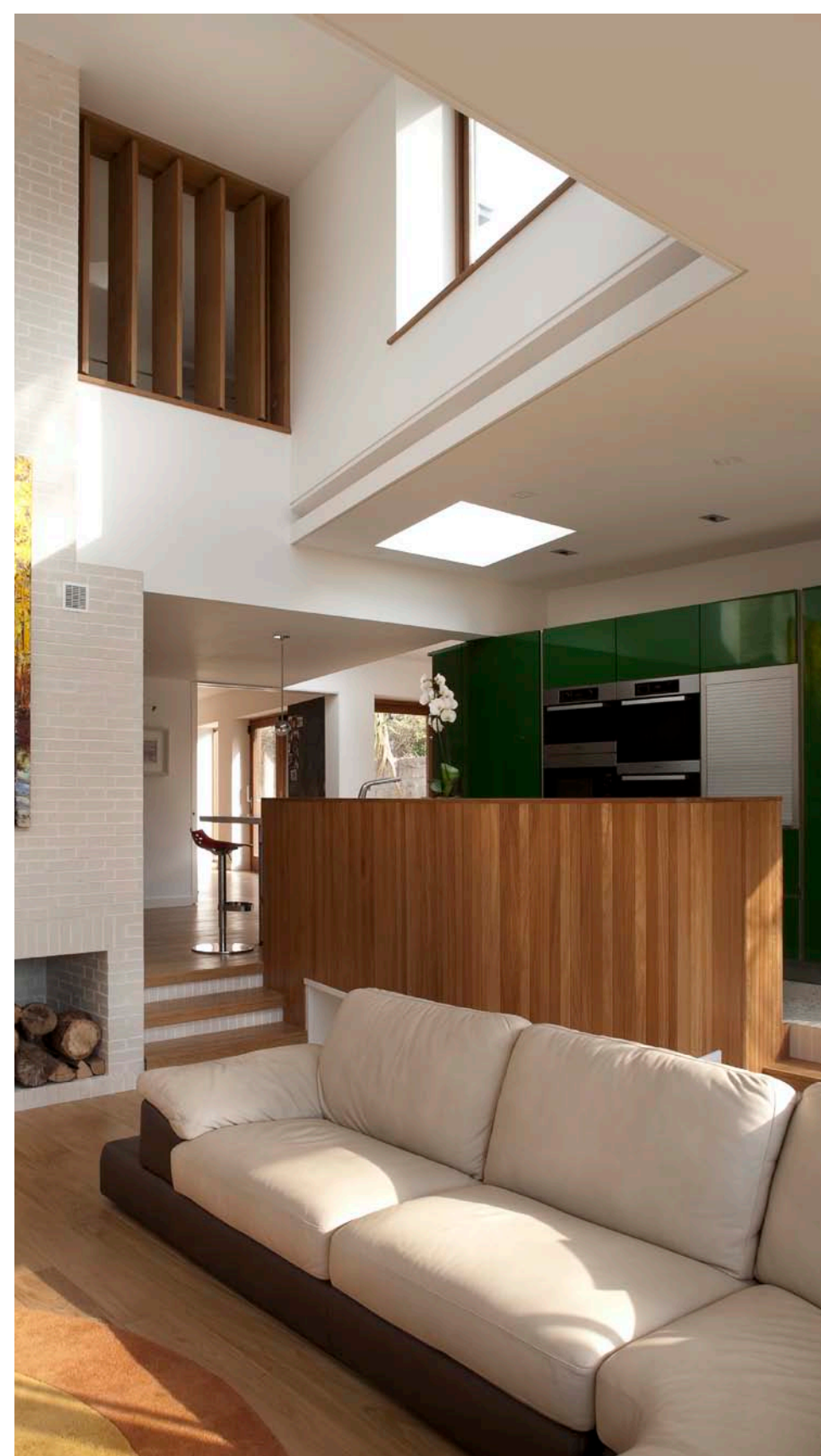
Hedge House, Ranelagh (images by Alice Clancy)